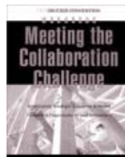
Meeting the Collaboration Challenge workbook and video are available for purchase from leadertoleader.org .

The Meeting the Collaboration Challenge curriculum was completed in 2002, and thirteen workshops were held across the United States. 500 nonprofit leaders attended, and an online version of the course was launched in January 2003.