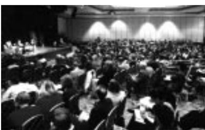
More than 500 leaders from all sectors attended the Fall Conference.

At the well-received, 1998 “Organization of the Future Conference,” presented in collaboration with The Conference Board, some of the world's leading visionaries and practitioners—including Peter Drucker by satellite—shared their perspectives on the purpose of tomorrow's organizations, new and future demands on leaders, tools for organizational change, and new models for organizations. Positive experiences at this first conference helped attract twice as many registrants to the February 1999 conference.