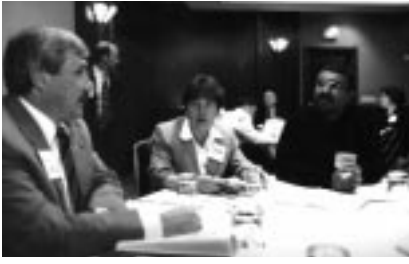
Participants at the Self-Assessment Tool Workshop at the Fall Wisdom to Action Conference.