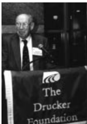
Peter F. Drucker, Honorary Chairman

“ I think my favorite organization re: improving the sector is the Drucker Foundation—they don't preach 'You should be like the other sectors.' Instead, they talk about the strengths of the sector, the diversity of the sector, and best practices in the sector. If you are interested in improving nonprofits, their literature is a great place to start. ”