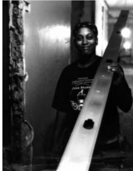
Common Ground Community's Times Square Jobs Training Program participant gaining skills and independence through Project Rebuild.

In its first two-and-one-half years, the TSJTP has assisted 123 tenants in achieving permanent positions paying an average of $18,000 a year and nearly 70 percent receive benefits. After two years, 78 percent remain employed. Common Ground Community is continuing to achieve innovation through its current supportive housing project, the rehabilitation of the Prince George Hotel, with Project Rebuild—a construction job-training program leading to union membership.