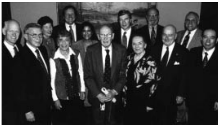
Members of the Peter F. Drucker Foundation Board of Directors and Board of Advisors at the Fall Conference.

And over 100 thought leaders who contributed by writing for publications and speaking at conferences for the Foundation.